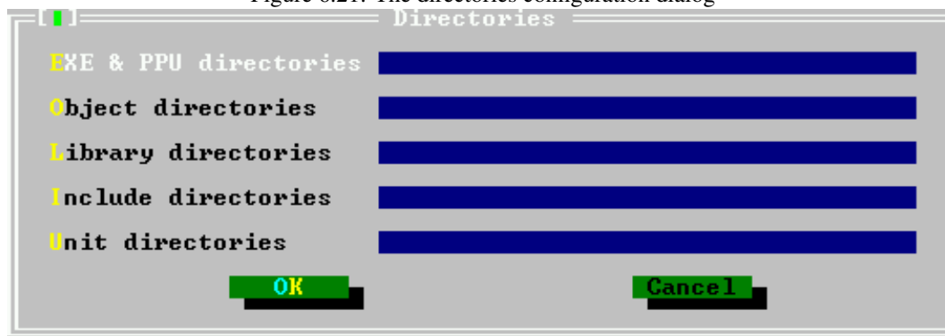
Figure 6.21: The directories configuration dialog

The following directories can be specified: