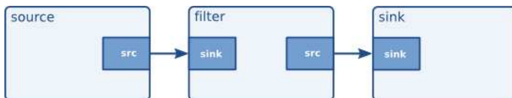
Figure 5-5. Visualisation of three linked elements

By linking these three elements, we have created a very simple chain of elements. The effect of this will be that the output of the source element (“element1”) will be used as input for the filter-like element (“element2”). The filter-like element will do something with the data and send the result to the final sink element (“element3”).