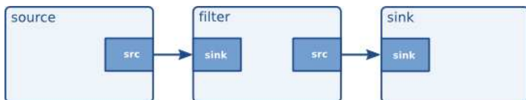
Figure 5-5. Visualisation of three linked elements

By linking these three elements, we have created a very simple chain of elements. The effect of this will be that the output of the source element (“element1”) will be used as input for the filter-like element (“element2”). The filter-like element will do something with the data and send the result to the final sink element (“element3”).