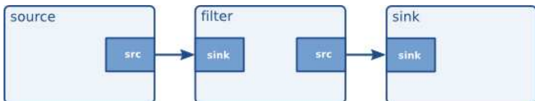
Figure 5-5. Visualisation of three linked elements

By linking these three elements, we have created a very simple chain of elements. The effect of this will be that the output of the source element (“element1”) will be used as input for the filter-like element (“element2”). The filter-like element will do something with the data and send the result to the final sink element (“element3”).