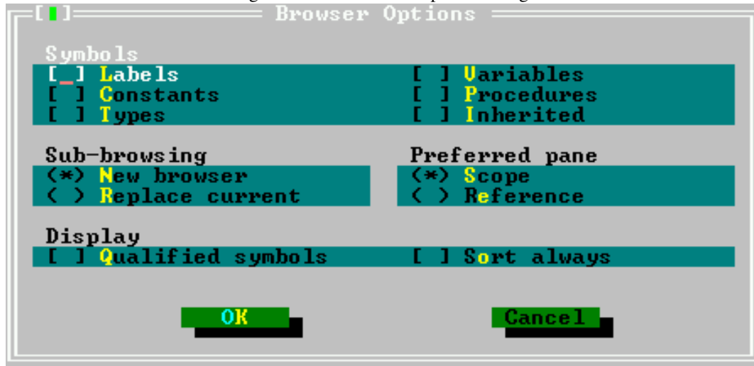
Figure 6.9: The browser options dialog.

Replace current The contents of the current window are replaced with the members of the selected complex symbol.