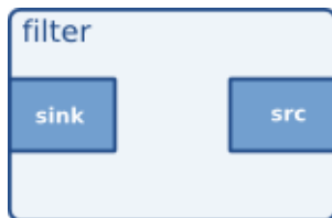
Figure 5-2. Visualisation of a filter element

Figure 5-2 shows how we will visualise a filter-like element. This specific element has one source and one sink element. Sink pads, receiving input data, are depicted at the left of the element; source pads are still on the right.