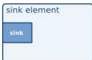
Figure 5-4. Visualisation of a sink element

Sink elements are end points in a media pipeline. They accept data but do not produce anything. Disk writing, soundcard playback, and video output would all be implemented by sink elements. Figure 5-4 shows a sink element.