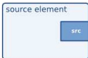
Figure 5-1. Visualisation of a source element

Source elements do not accept data, they only generate data. You can see this in the figure because it only has a source pad (on the right). A source pad can only generate data.