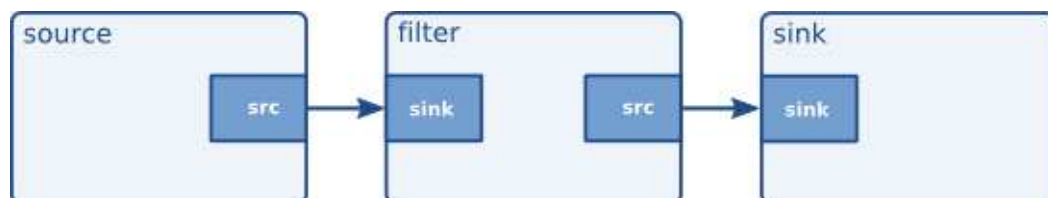
Figure 5-5. Visualisation of three linked elements

By linking these three elements, we have created a very simple chain of elements. The effect of this will be that the output of the source element (“element1”) will be used as input for the filter-like element (“element2”). The filter-like element will do something with the data and send the result to the final sink element (“element3”).