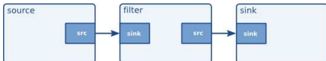
Figure 5-5. Visualisation of three linked elements

By linking these three elements, we have created a very simple chain of elements. The effect of this will be that the output of the source element (“element1”) will be used as input for the filter-like element (“element2”). The filter-like element will do something with the data and send the result to the final sink element (“element3”).