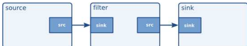
Figure 5-5. Visualisation of three linked elements

By linking these three elements, we have created a very simple chain of elements. The effect of this will be that the output of the source element (“element1”) will be used as input for the filter-like element (“element2”). The filter-like element will do something with the data and send the result to the final sink element (“element3”).