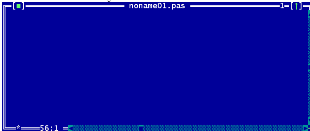
Figure 6.2: A common IDE window

The window is surrounded by a so-called frame , the white double line around the window.