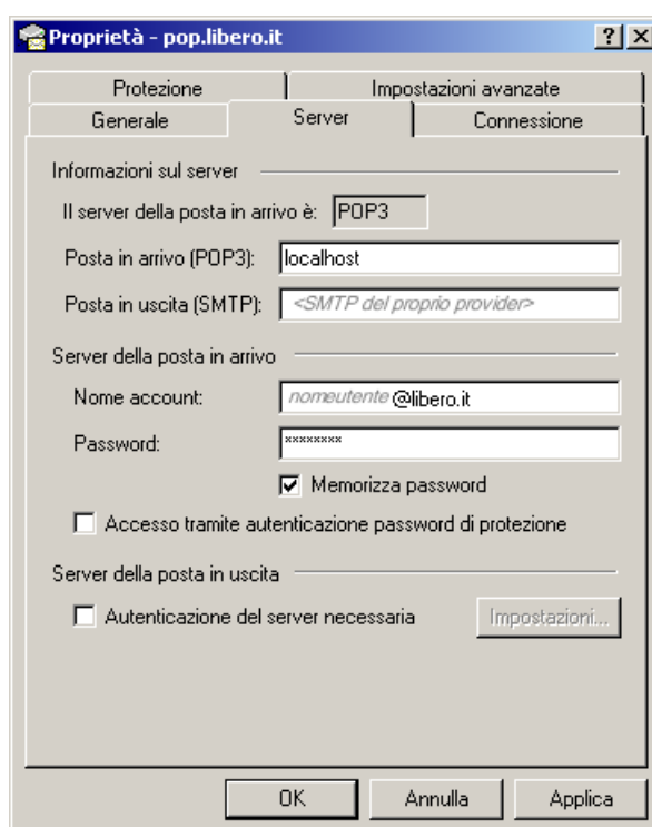
Figure 3: server