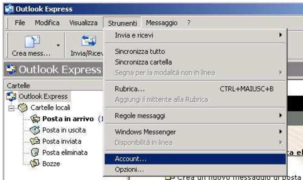
Figure 1: main