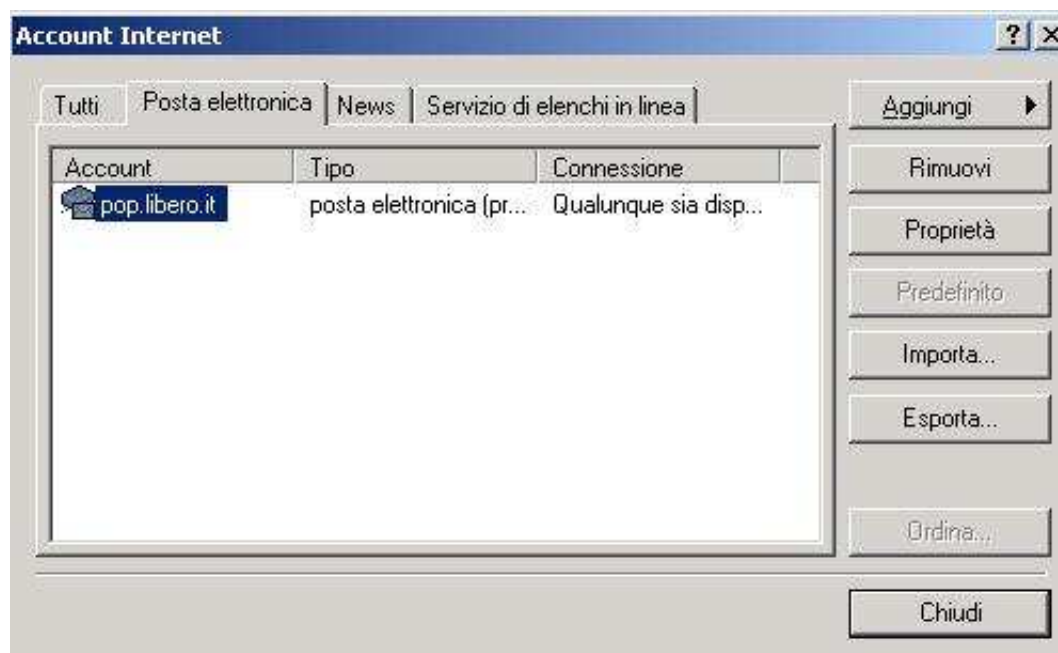
Figure 2: settings