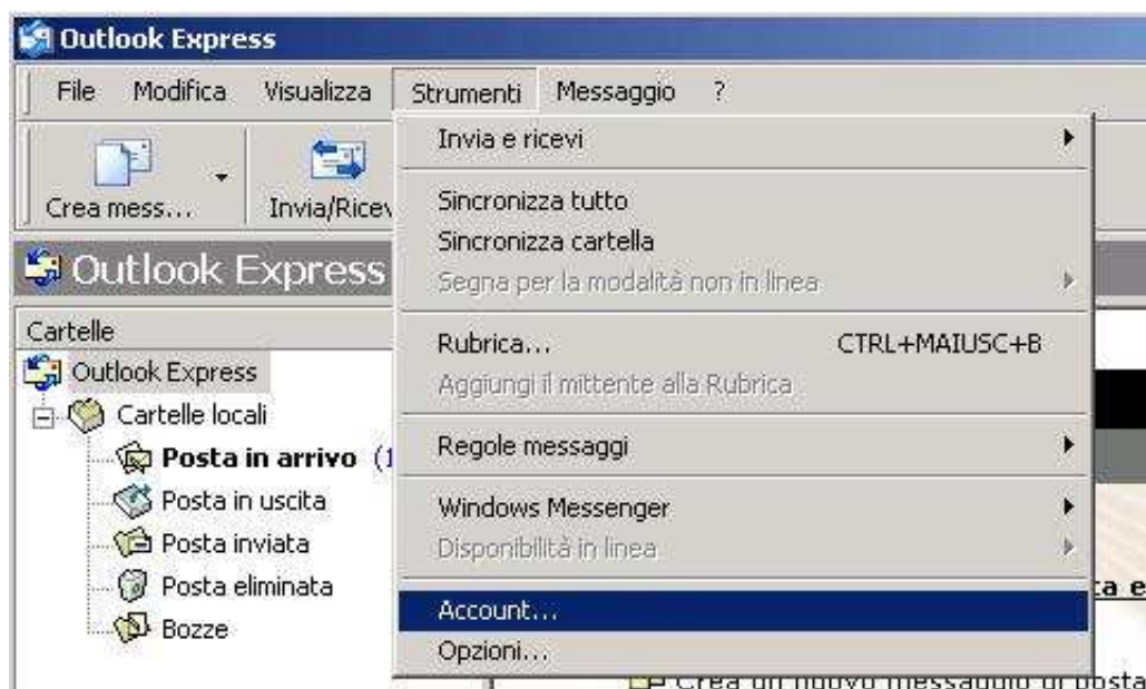
Figure 1: main