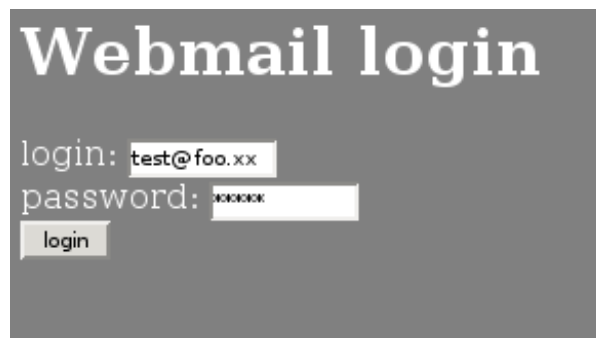
Figure 5: login

Now that we know how FreePOPs will act during the login we have to implement the login in the webmail, but first uncomment the few lines in the init() function (that is called when the plugin is started), that loads the browser.lua module (the module we will use to login in the webmail). Here is the webmail login page viewed with Mozilla and the source of the page (you can see it with Mozilla with Ctrl-U, figure 5).