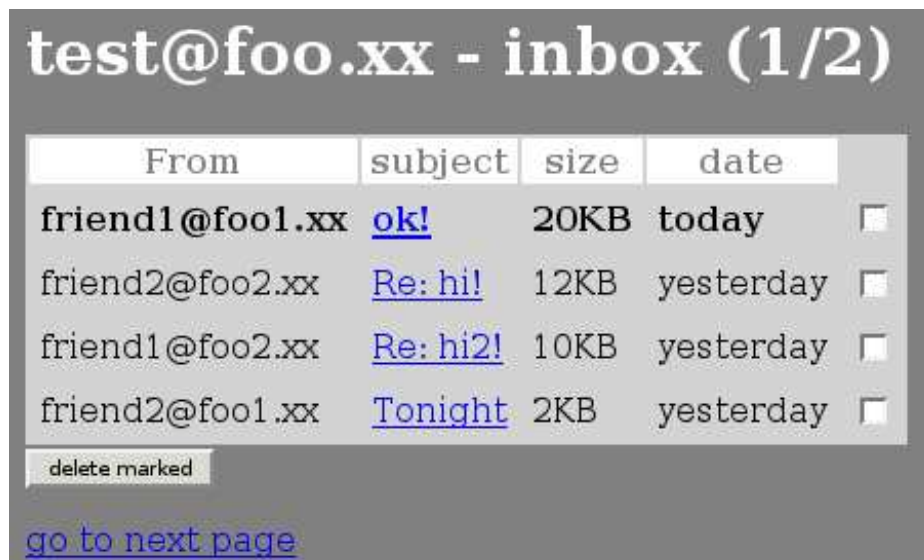
Figure 7: inbox

Now we have to implement the stat() function. The stat is probably the most important function. It must retrieve the list of messages in the webmail and their UIDL and size. In our example we will use the mlex module to grab the important info from the page, but you can use the string LUA module to do the same with captures. This is our inbox page (see figure 7)