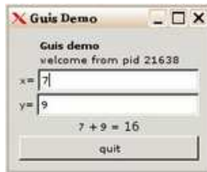
Figure 1: Simple example demo window

For illustration purpose, suppose we have an application which computes the sum of 2 integers, and we want to give it a nice graphical interface containing two (editable) textual entry widgets, a quit button, and a label widget displaying the sum.